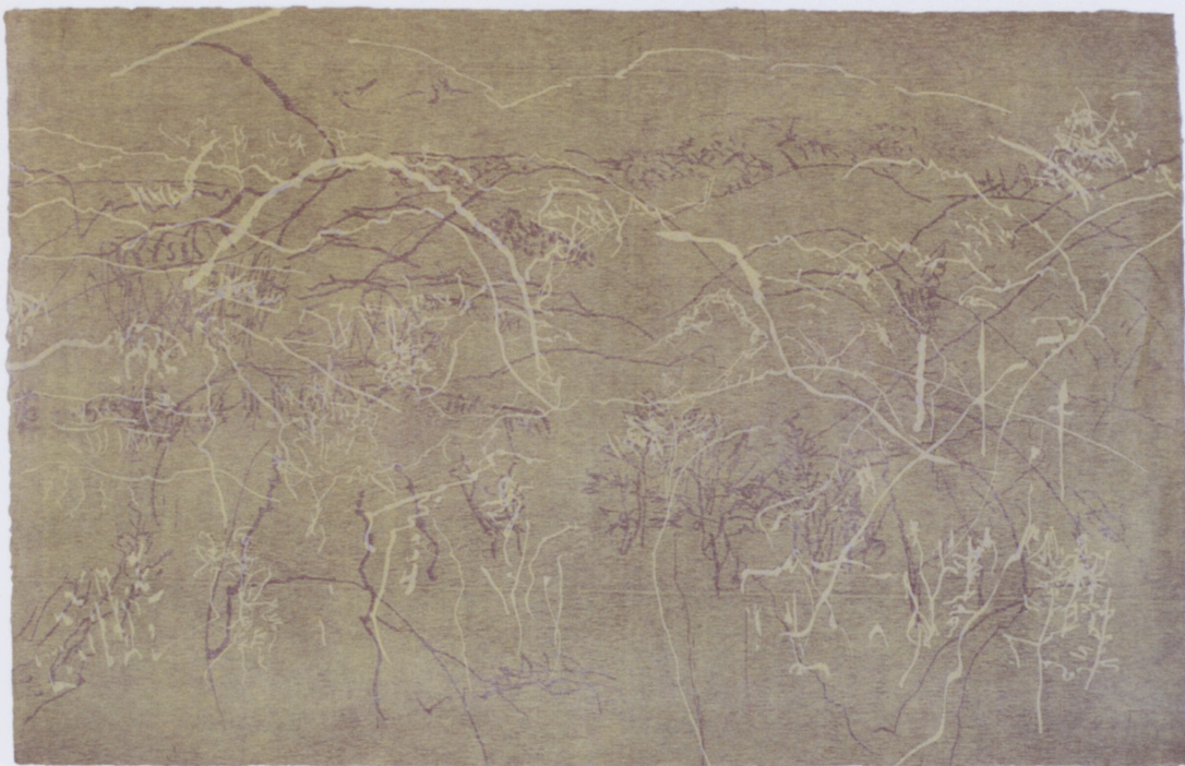
Claybank Hills , woodcut, 24" x 39", edition of 11, 2013