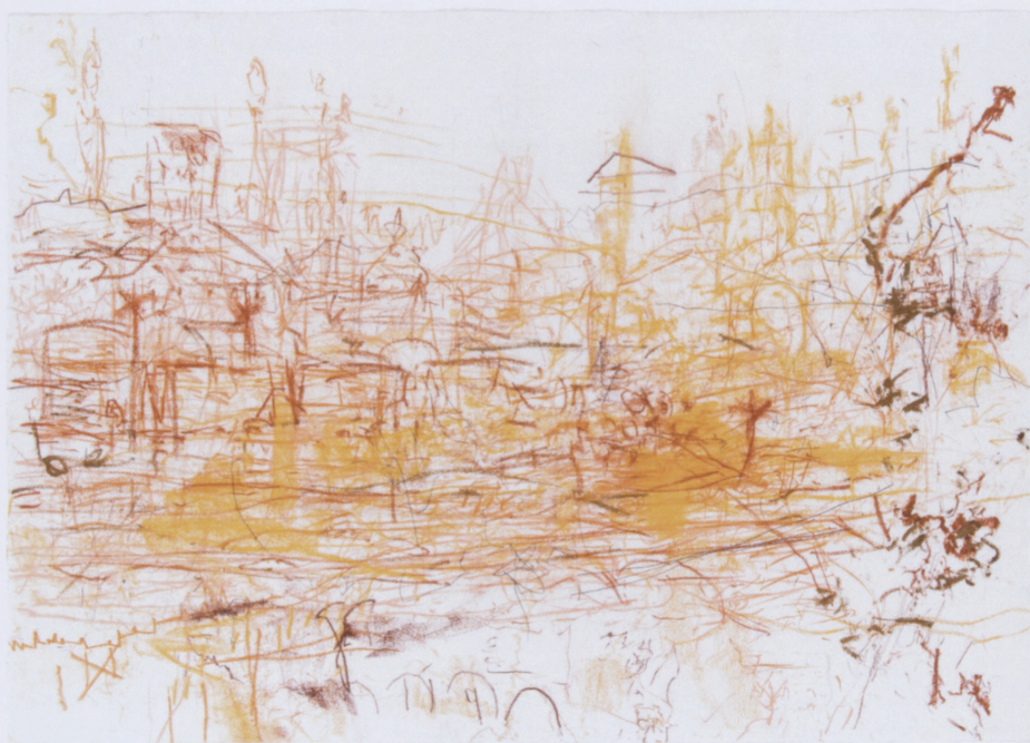
Moose Jaw Railyard , felt pen, graphite, pastel, oil paint stick, oil pastel, conté, 29½" x 41½", 2012